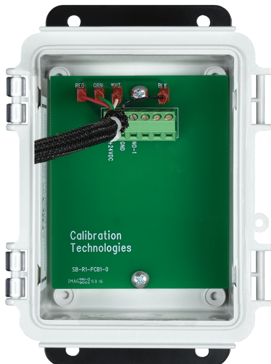
SB-R1 and SB-S1