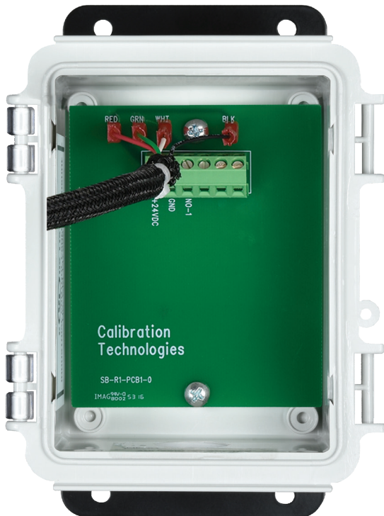
SB-R1 and SB-S1